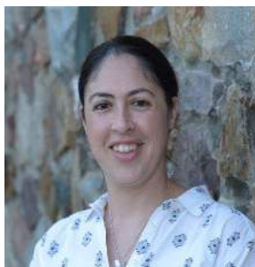
RABBI ANAT KATZIR