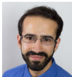
RABBI DR. MATTHEW GOLDSTONE P'NEI TORAH FACULTY AWARD